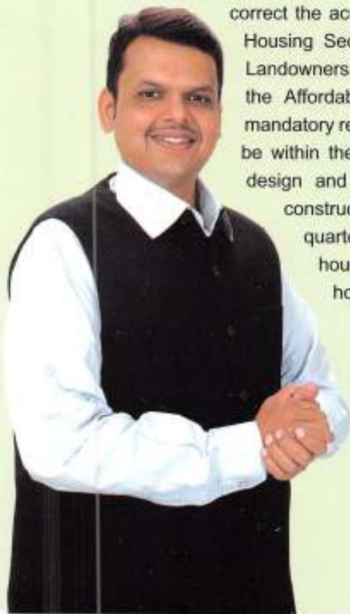
Shri. Devendra Fadnavis Chief Minister, Government of Maharashtra

I wish grand success to this workshop organised for brain storming deliberation and interaction to achieve the vision.