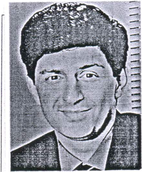
Mr. Boman Irani